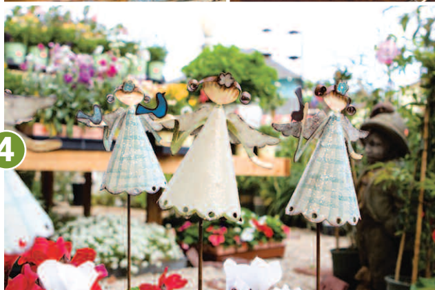
Please call to check hours and availability of businesses, attractions, and events before you visit. Orange Chamber of Commerce, (714) 538-3581; orangechamber.com .