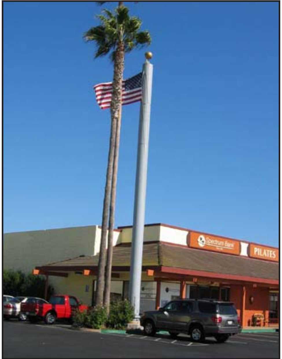
Example of stealth flagpole. Two of these, side-by-side, are proposed.

The City of Orange seems to be pushing this project because of the substantial revenue these installations generate. It is our understanding that the new library tower was supposed to house these wireless facilities but the deal somehow fell through. This option may need to be re-visited as the current proposal has a significant impact on our Historic District. We understand the need for our city to seek alternative methods of generating additional revenue, but it should not be at the District's expense. A more acceptable alternative needs to be explored.