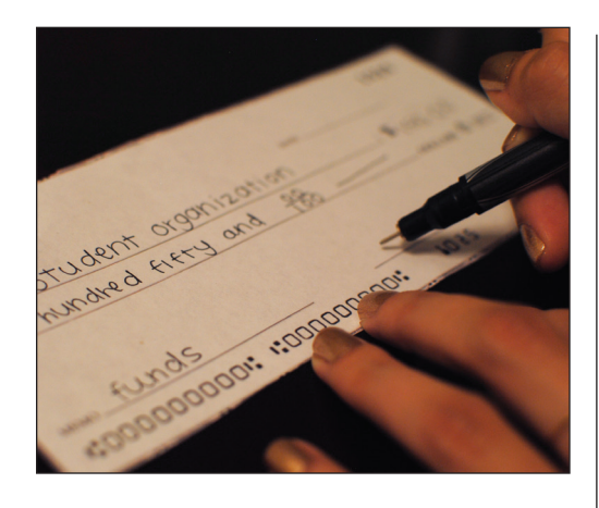
A student was caught increasing the amount on a funding request check from student government.