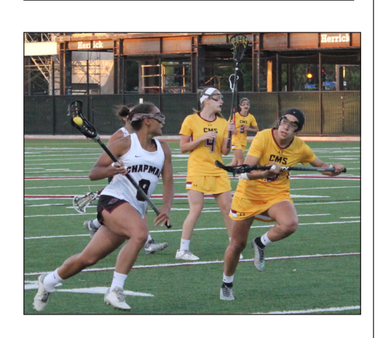
Women's lacrosse loses to Claremont-Mudd-Scripps in conference finals. Sports, Page 16