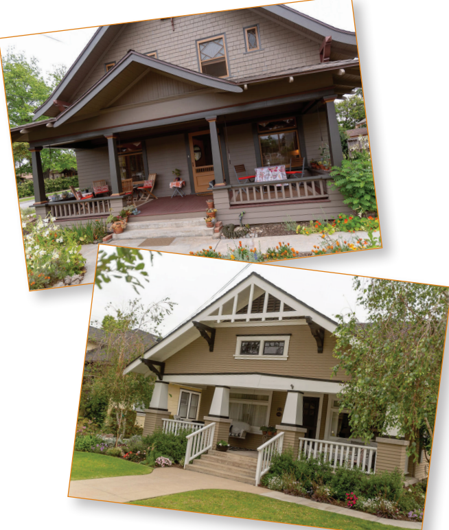
Recent Sweet, Sweet Orange Preservation Award winners were these two Old Towne classics.

If you spot a significant neighborhood preservation or restoration at a home, business structure or garden, submit an online or email nomination at otpa.org. Yes, nominate your own work!