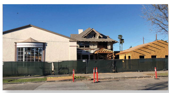
THE FUTURE RICHLAND HOTEL

Enjoy Old Towne's most popular Spring social event. Join us in celebrating improvements in legendary homes, gardens and business buildings. ORDER TICKETS AND TABLES NOW online at otpa.org