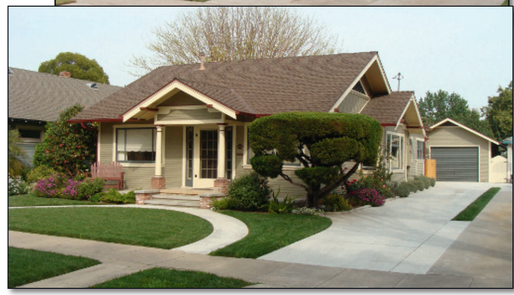
Zdenek home before (top image) & after (above)