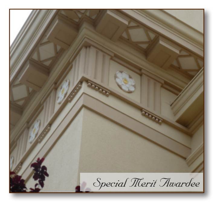
Memorial Hall Details

This year's program included two Special Merit Award recipients. The first award was given to Chapman University for restoration of Memorial and Roosevelt Halls. The neo-classical buildings, constructed in 1921 and 1928, were repaired and painted in original colors. One of the most noticeable changes is in the plaster relief detailing which was