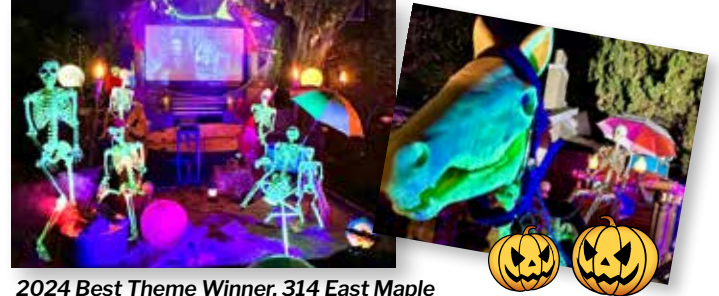
2024 Best Theme Winner, 314 East Maple

The judges will tour Old Towne to select the winners.